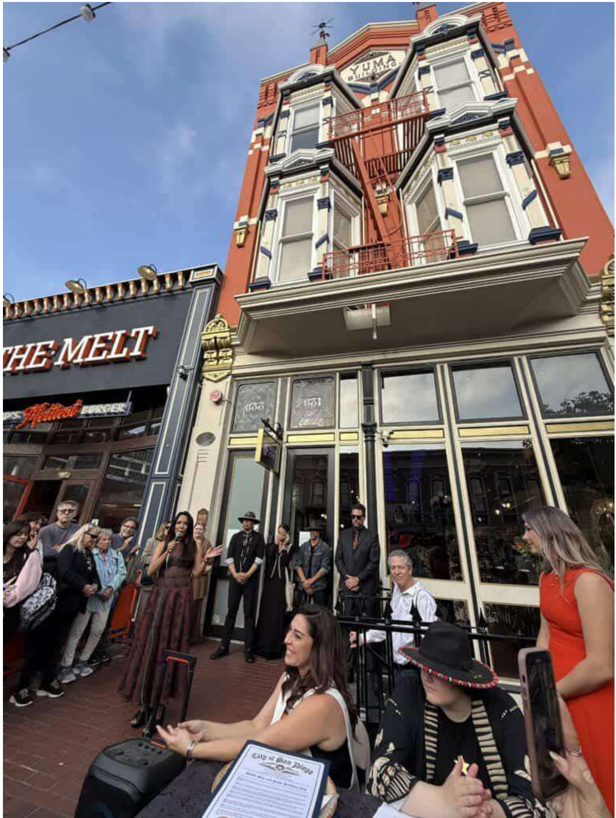
The celebration for Native Star Boutique welcomed bird singers and dancers along with tribal peoples from across Southern California and beyond.